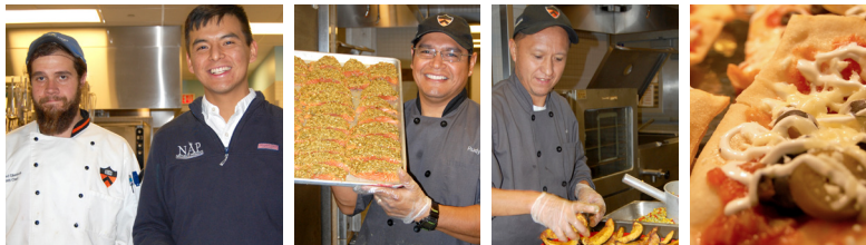
The Whitman dining staff celebrated Native American Heritage Night on November 8

Campus Dining will open its latest retail outlet, the Atrium Café, in the newly renovated 20 Washington Road building in early January. The café will feature specialty coffee options including espresso and cappuccino, as well as light breakfast and lunch options.