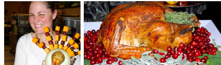
Residential units celebrated Thanksgiving on November 18