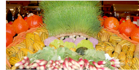
The “rainbow of autumn harvest vegetables” was beautifully arranged by Violette Chamoun

Flexitarian Night was a collaboration with the Forbes College Office and Princeton Environmental Institute. Read more