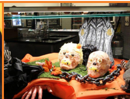
Did You Know?