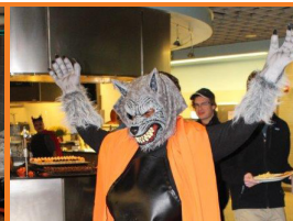
Dates to Remember